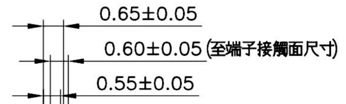
A-A SECTION SCALE 2:1